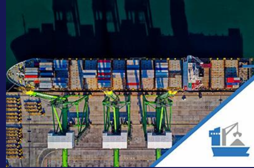
Ports and terminals