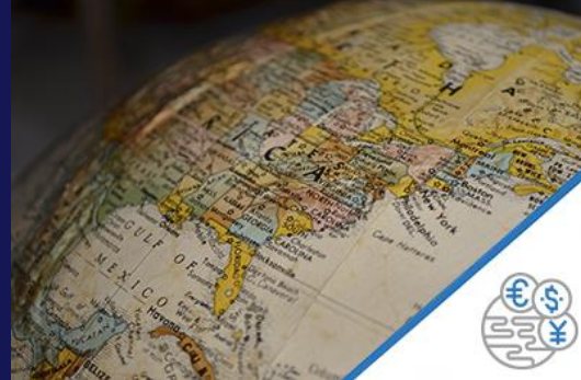
Legal support of FEA