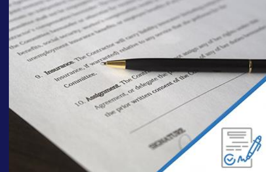
Business sale & purchase