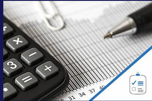
Corporate and taxes