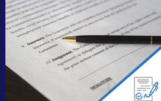
Business sale & purchase