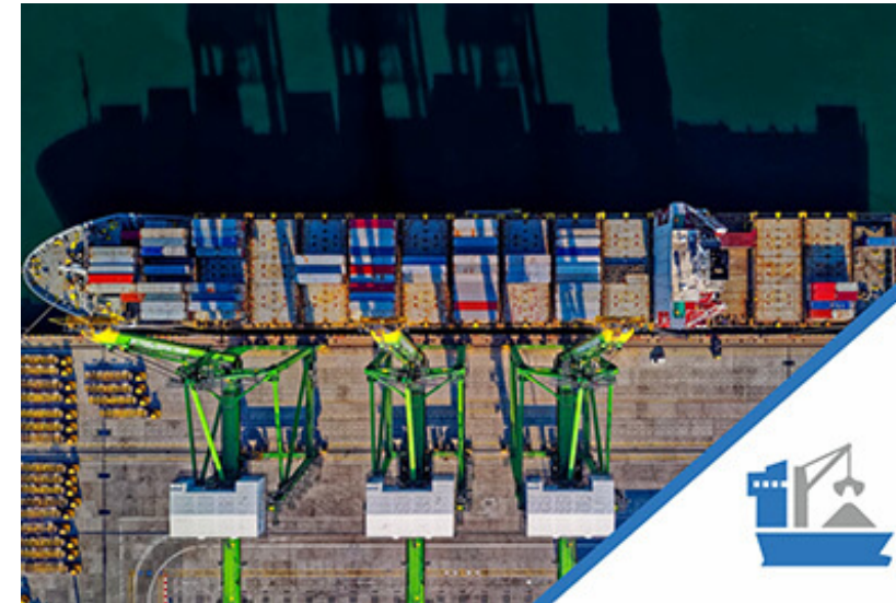
Ports and terminals