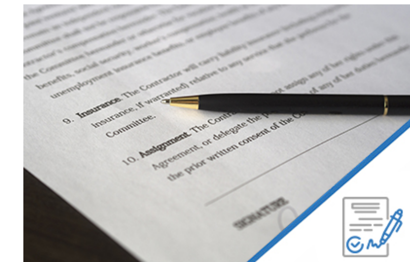
Business sale & purchase