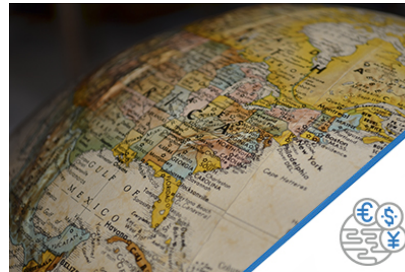
Legal support of FEA