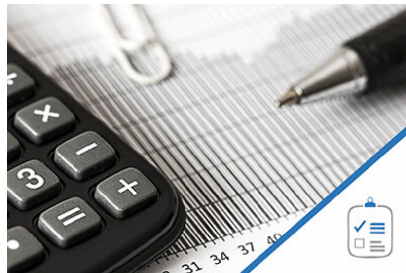
Corporate and taxes