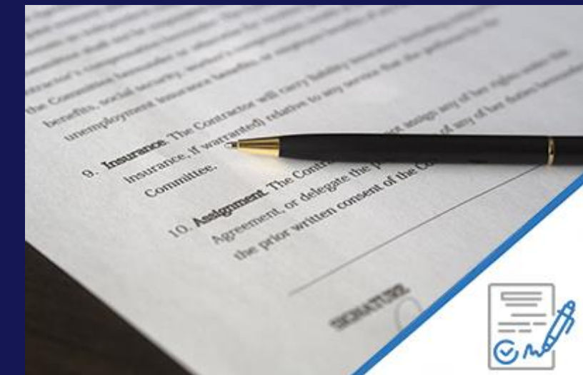
Business sale & purchase