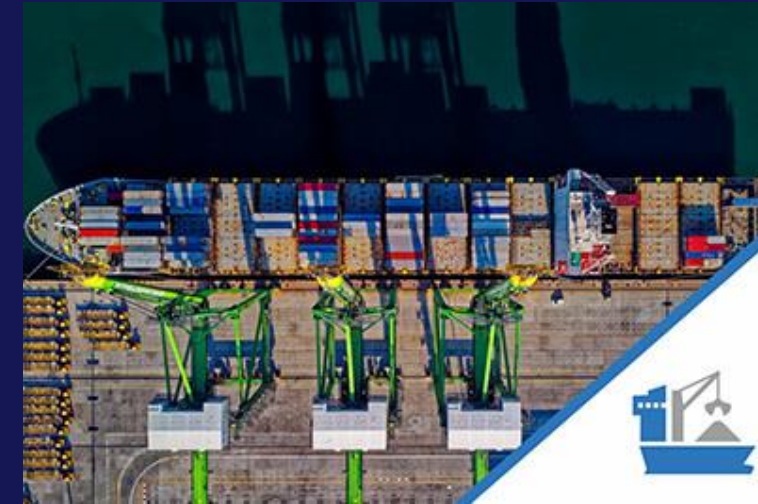
Ports and terminals