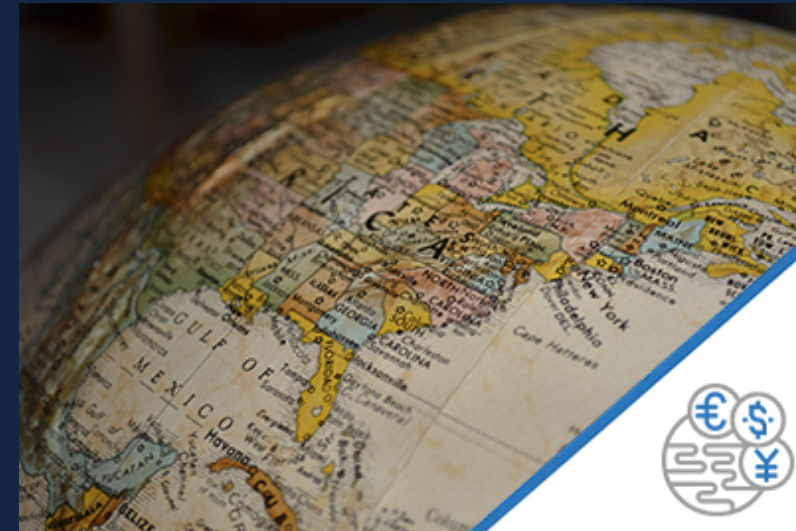
Foreign economic activity